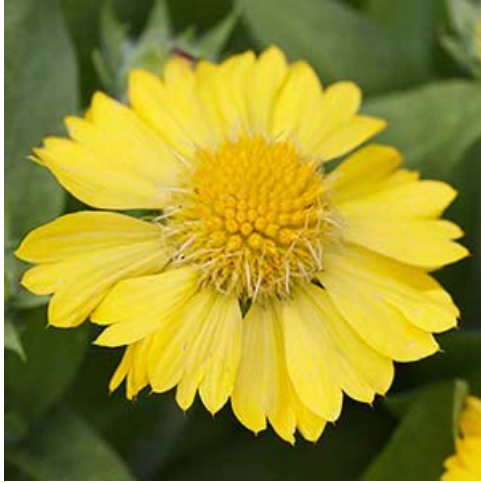
Gaillardia 'Mesa Yellow'

If you're struggling with what to plant in a hot, sunny spot in your yard, try gaillardia. This easy-care perennial is simple to grow as long as it has at least 6 hours of direct light per day and well-drained soil (amend clay soils with organic matter before planting to increase drainage).